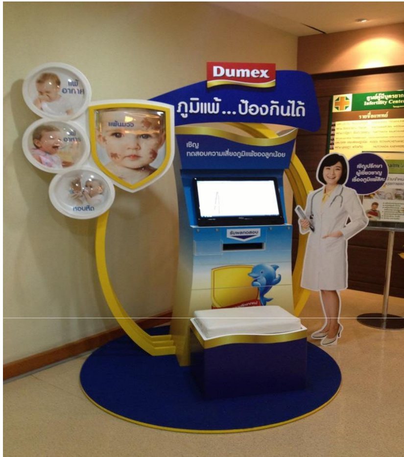
Displays in the private hospital